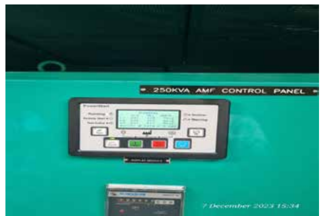
Completed I&C of 250 KVA DG sets within budget, including additional necessary upgradation of AMF panel to handle the new DG