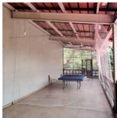
Table Tennis playing area created that can be quickly brought down to accommodate additional tables for Raintree verandah as and when needed and then set back up.

Monthly fire drills being conducted since Mar-24 and emptied fire extinguishers are sent for annual refilling. Once 6 cycles are completed, we will migrate to bimonthly fire drills, where 15% of the fire extinguishers routinely get emptied and refilled in each cycle.