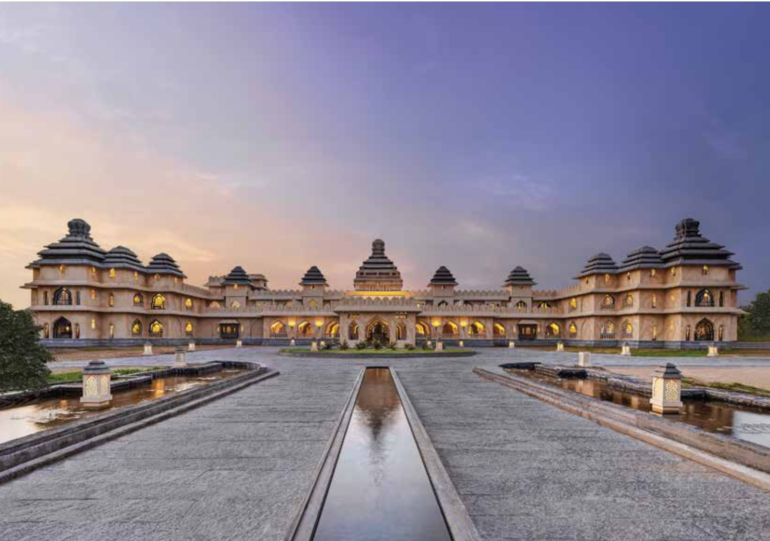
Evolve Back Kamalapura Palace, Hampi