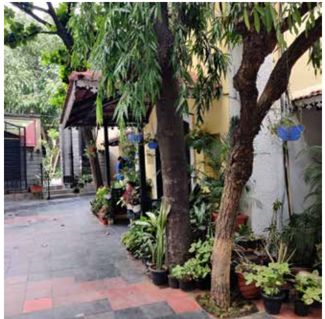
Burgeoning Garden adding life and spirit to the club environs