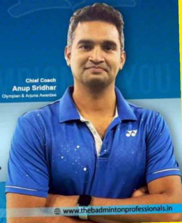
Chief Coach Anup Sridhar Olympian & Arjuna Awardee